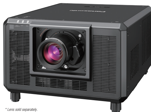
* Lens sold separately.